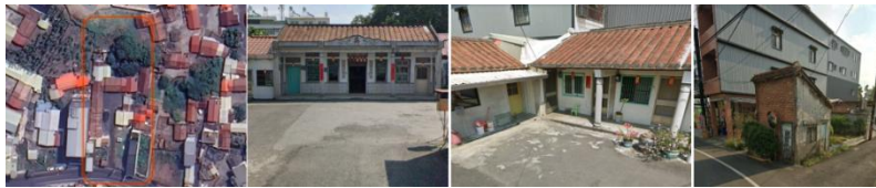
Figure 1. The ancestral house built by my ancestors in 1685 is highlighted within the red frame in the photograph. The central structure is the main hall, while the white-roofed building in the lower-left corner of the red frame is a three-story qilou that was reconstructed to face the street. The aerial photos were taken by drone during this study. The other photos were taken by this study, and the red frames are added by this study. (There are no copyright issues.)

The ancestral house built by my forebears is located in the Zhongdui Zhutian area. Originally constructed as a traditional quadrangle courtyard, it has since been remodeled to accommodate modern car access.