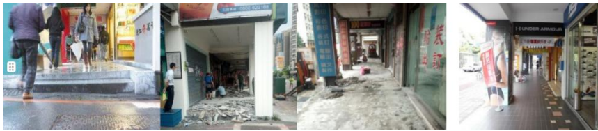
Figure 3. 1. Uneven surfaces of Taiwan' s qilou . 2. Removal of the original uneven floor tiles. 3. Leveling construction in progress. 4. Completed leveling work.

All photos were taken for this study. (No copyright issues.)